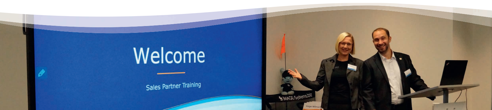
IMAGE Information Systems solutions are proven around the world. Take a look at selected installations and learn more about how our products can meet the requirements of radiological projects and facilities.