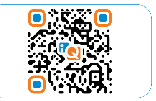
Give it a try by scanning this QR code or find out more about iQ-WEB UPLOADER on <u>https://image-systems.biz/iq-web-uploader/</u>.